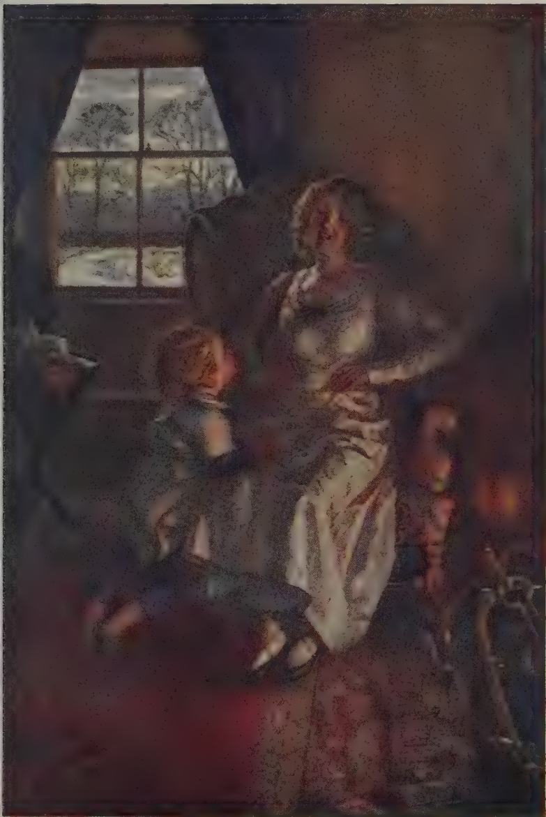
MY MOTHER IS OUT OF BREATH AND RESTS HERSELF IN AN ELBOW-CHAIR